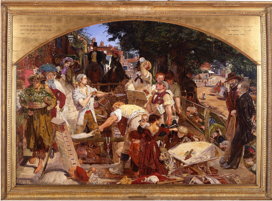
Work, Ford Madox Brown