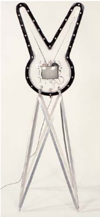
Vacuum , 1994, Steven Pippin